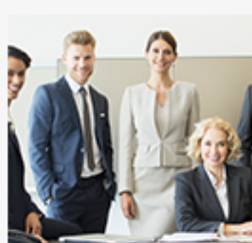
coworker / marketer

Nice to meet you. I'm glad you could join us today.