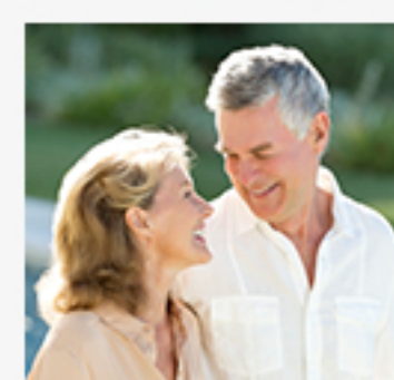
husband / soccer coach