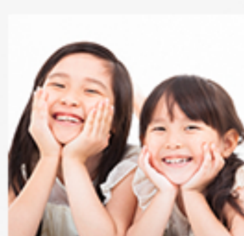
daughter / ballerina